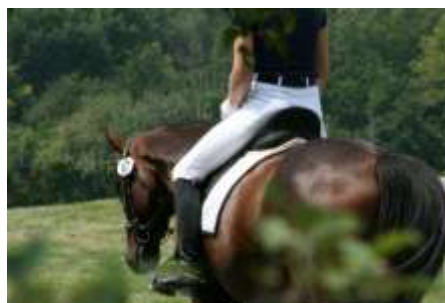
Caitlin Milford & Moonlight Chaser