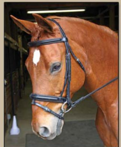
Joseph Sterling® Dressage Snaffle Bridle with Crank