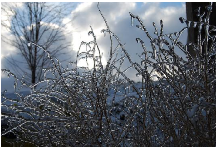
Winter seizes Ledge Hollow Stable in Medina, Ohio