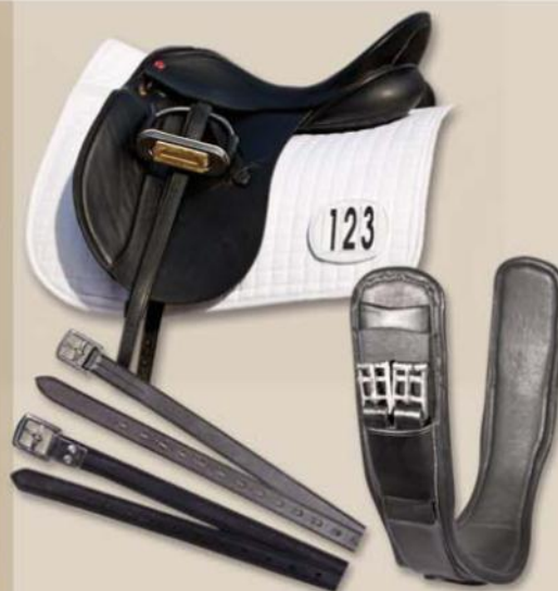
Dressage Accessories from Joseph Sterling® & EZ View®