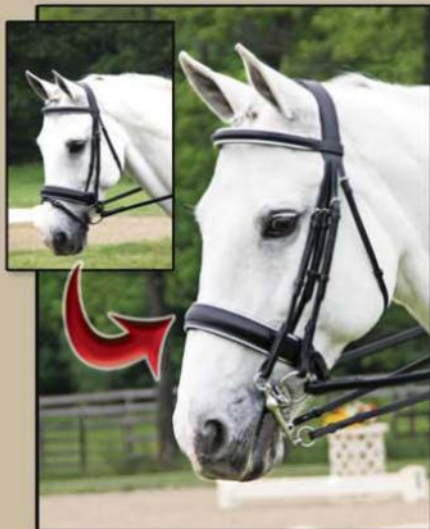
Joseph Sterling® Dressage Conversion Bridle

Visit SSTACK.COM Today and Shop our Dressage Collection