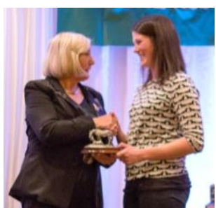
Musical Freestyle (above right)