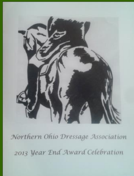
Rachel Jelen's pen and ink drawing on the cover of the 2013 Year-End Celebration Program.

NODA regrets the omission and sends sincerely apologies for the oversight.