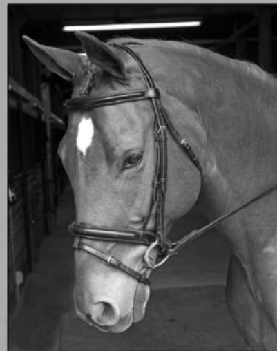
Joseph Sterling® Dressage Snaffle Bridle with Crank