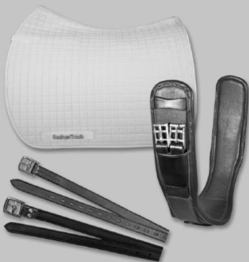
Dressage Accessories from Joseph Sterling® & Back on Track®