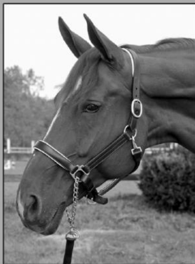
Joseph Sterling® Aachen Dressage Halter & Lead

Visit SSTACK.COM Today and Shop our Dressage Collection