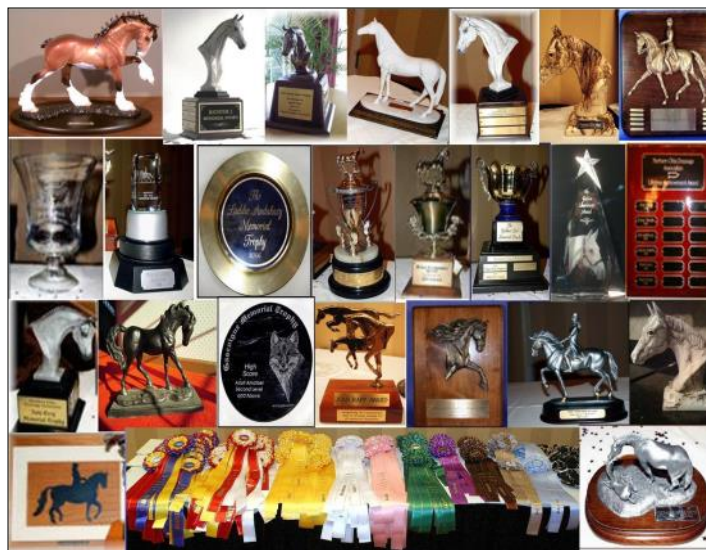
NODA members are eligible for year-end awards, scholarships, and many other benefits whether a junior, adult amateur, or a professional!

Young Riders: You are the future of this sport. You get all the benefits of an AA, and NODA has classes at shows and scholarships specifically for youth. NODA schooling shows have readied many youth to go on to recognized competitions and many have gone on to ride Grand Prix or start their own careers as professional dressage trainers/instructors. Joining your GMO is a way to find out what is out there so you can plan future riding goals. One season at a time, NODA will help you grow from local, to regional, and on to the national levels in dressage if that's your goal.