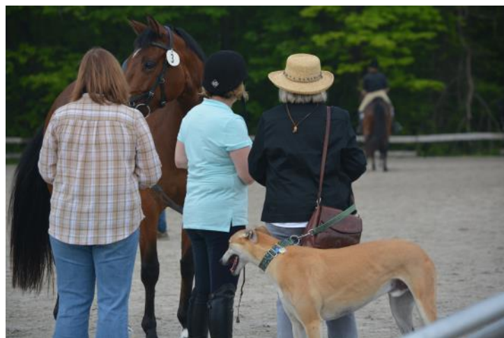
At the warm up area at Chagrin Valley Farms