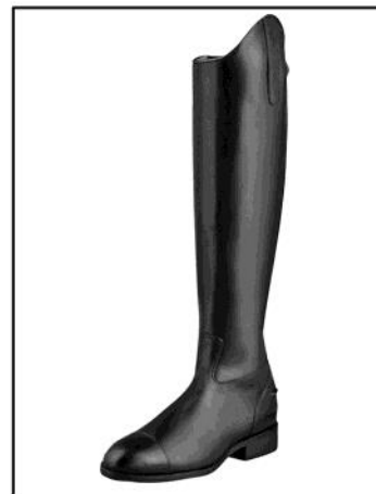
Ariat Westchester Boot

Saddle Fittings & Evaluations, Custom boots, Semi Custom Show Coats, & more!