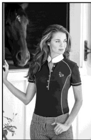
Iconic Show Shirt