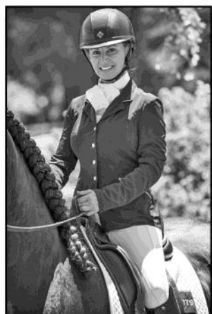
FIT's Zephyr Coat

Track right into our Streetsboro location so we can help you on your journey with your equine partner!