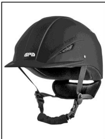
GPA Easy Helmet