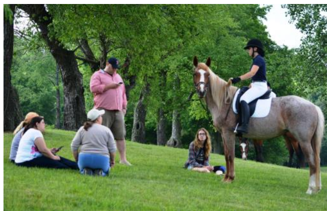
Right: Family and friends supporting a competitor