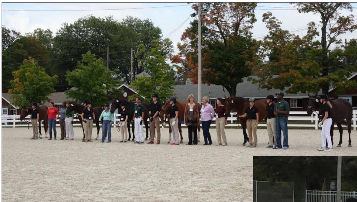
Left: Participants at the USDF Youth Handler's Seminar at Dressage at Devon.