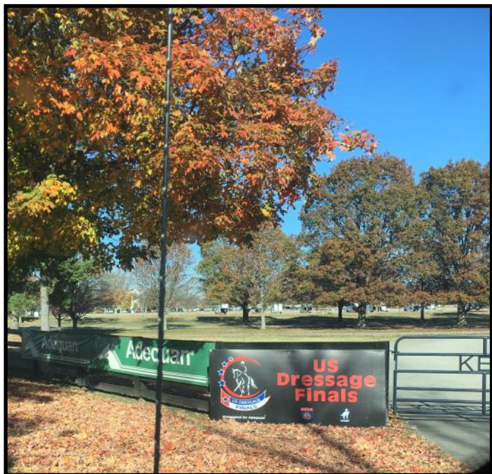
Grounds of the US Dressage Finals at the Kentucky Horse Park